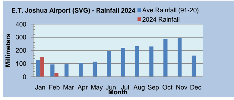
Tables 1&2: February, 2024: Rainfall across SVG.

The highest maximum temperature, 30.7°C, was recorded on the 1st and 22<sup>nd</sup>; the lowest minimum temperature was 20.1°C, recorded on the 29^{th} The Average maximum temperature was 29.9^{\circ}C and Average minimum temperature was 22.7°C. Average daily mean temperature was 26.3°C.