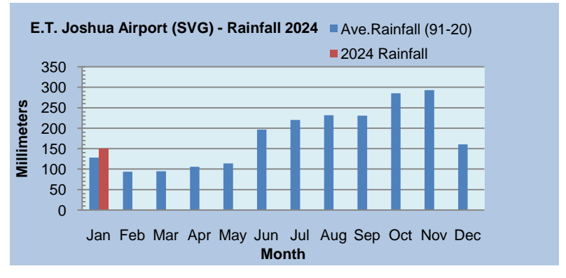
Tables 1&2: January , 2024: Rainfall across SVG.

The highest maximum temperature , 30.4, was recorded on the 307<sup>th</sup>; the lowest minimum temperature was 19.7°C, recorded on the 27<sup>th</sup> The Average maximum temperature was 29.0°C and Average minimum temperature was 21.6°C. Average daily mean temperature was 25.3°C.