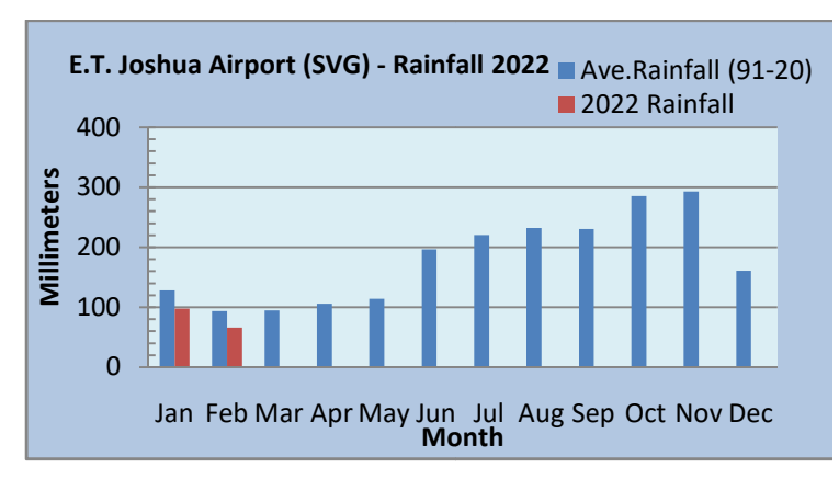
Table 1&2 February, 2022 Rainfall across SVG

The highest maximum temperature 29.0°C was recorded on the 16<sup>th</sup>, while the lowest minimum temperature value of 19.0 °C was recorded on the 26<sup>th</sup>. Average maximum temperature was 28.1 °C and Average minimum temperature was 21.6 °C. Average daily mean temperature was 24.9 °C.