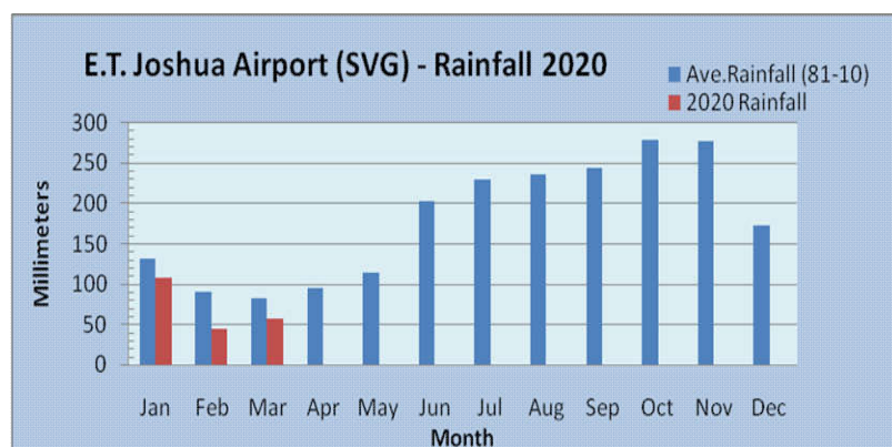
Figure 2. Comparison of average rainfall (period 1981 to 2010) and 2020 rainfall at E.T. Joshua Airport - Arnos Vale

The maximum wind gust of 27 knots (~50 km/h or 31 mph) was recorded on 20th March 2020.